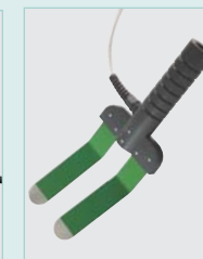
MO290-BP Moisture Baseboard Probe