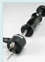
MO290-HP Moisture Hammer Probe