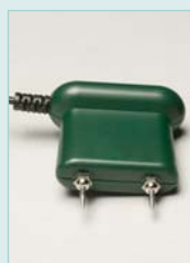
MO290-P Moisture Pin Probe